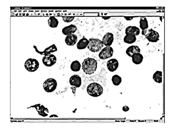
Figure 2. Screenshots of "Contour" for measurement of conglomerate of cells

Figure 1. Screenshots of "Contour" for measurement of separate cell